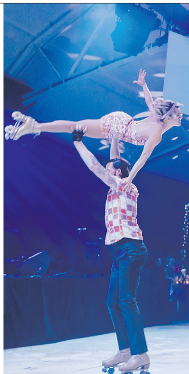
ROLLING WITH IT: World-famous, Cali-based acrobatic roller-skaters the Rock n'Rollers wow with choreography by Emmy-nominated Fred Tallaksen. KAREL CHLADEK