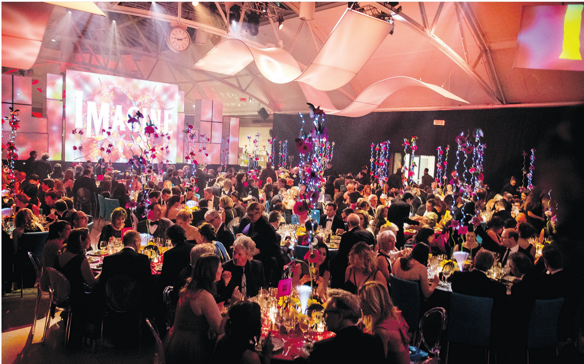
BEYOND EXPECTATIONS: Six hundred and fifty jaws dropped as guests entered an electrified '60s-inspired space beyond even the Beatles' epic imaginations, at the 2017 Daffodil Ball benefiting the Canadian Cancer Society. STEPHANE POIRIER