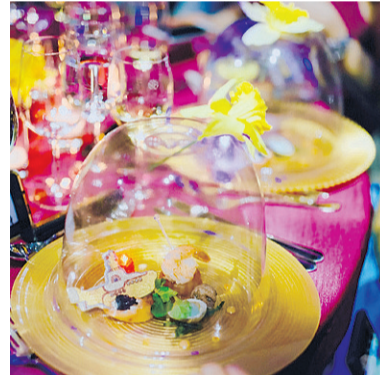
FOODIE FUN: Queen E chef-wizards take presentation seriously, with themed courses like a Yellow Submarine appetizer at the Daffodil Ball. KAREL CHLADEK